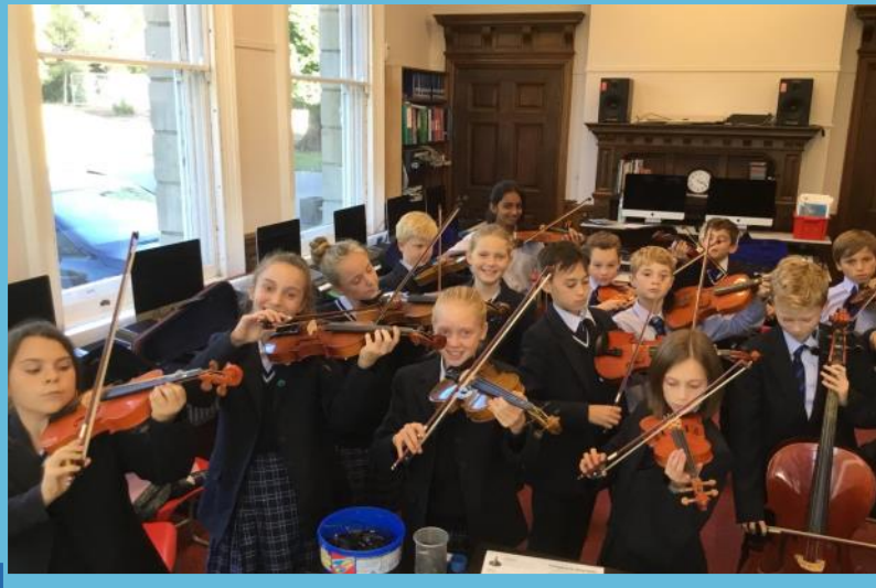
Year 7 have been learning about the bowed string family. They learnt how to play in time, developed their musical awareness, and demonstrated ‘arco’ and ‘pizzicato’.