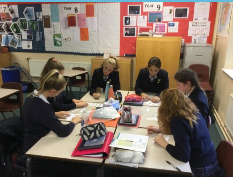
Year 10 Spanish working hard in groups to improve their translation skills.