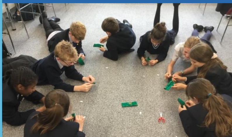
Year 8 have been learning some basic stitches for their electronic textiles project.