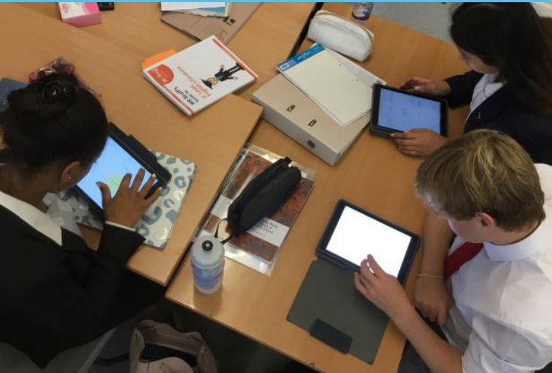
“Who’s winning?” Year 12 students test each other on terminology using activities they have created on Quizlet.