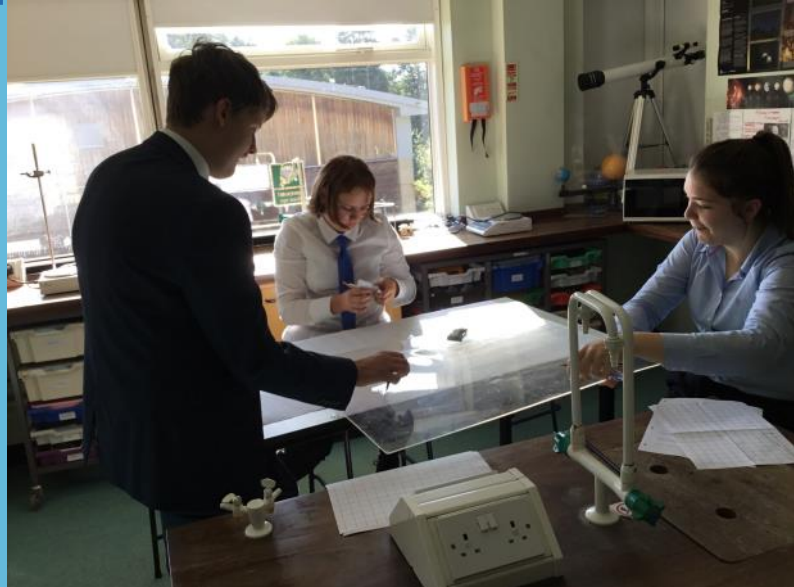
Year 12 physicists investigating velocity vectors with toy cars.