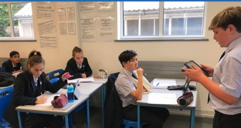
Year 9 are studying war poetry in English. They’ve been giving presentations on war and propaganda.