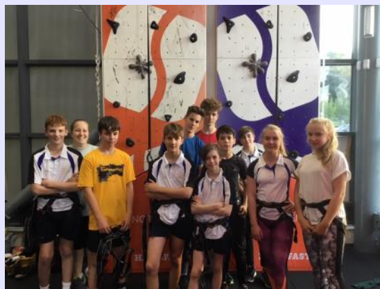
New club! The Dunottar School Climbing Club had a great first session at K2, Crawley on Friday afternoon.