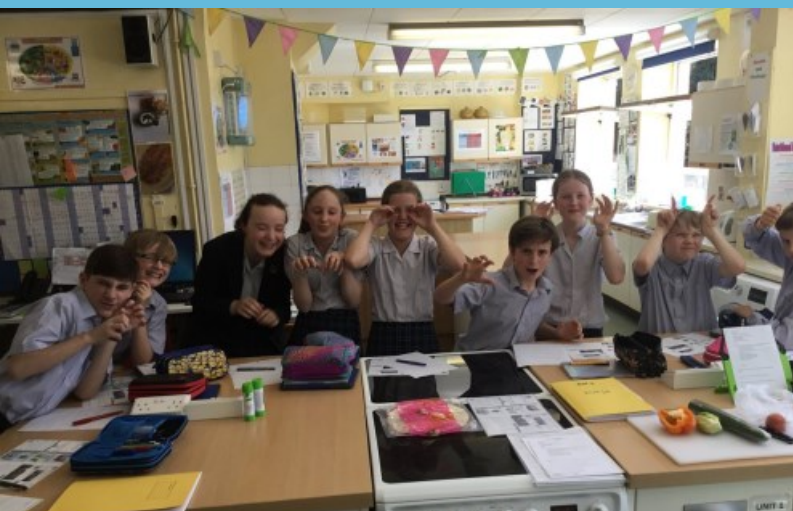
Year 7 have been pretending to be evil bacteria in the Danger Zone.