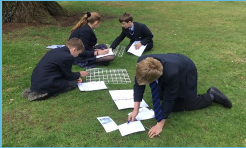
Y7 Biologists using quadrats to sample the plants growing in the school grounds.