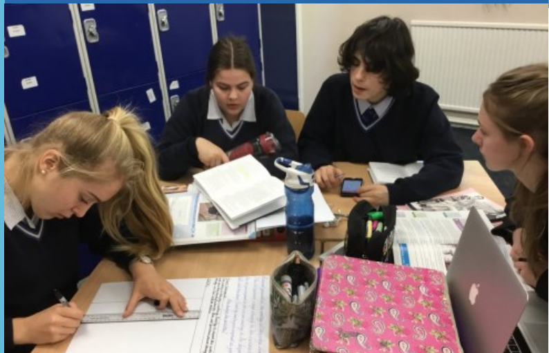
Our Year 11 English pupils have been working collaboratively to create group plans for possible exam questions.