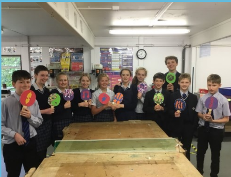
Year 8 Design & Technology pupils showing off their finished ergonomically designed table tennis bats.