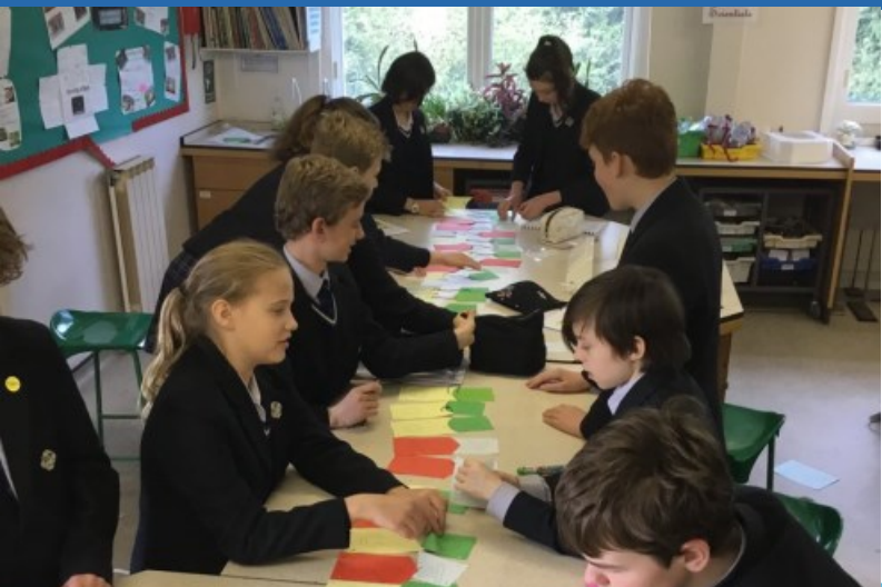
Year 8 pupils have been building a strand of DNA from scratch.