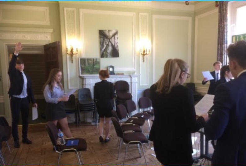
Sixth Form students taking part in a "Presentation Skills" workshop.