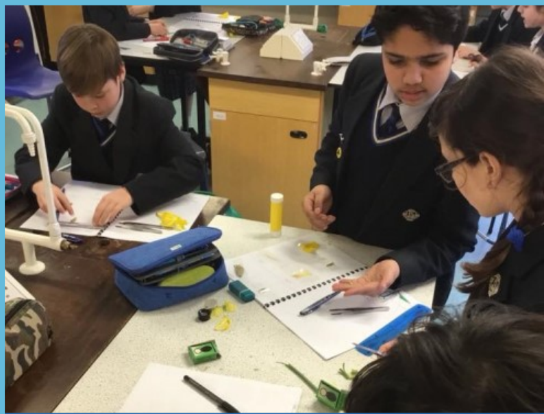
Interesting lessons based on daffodils as Spring approached. In English, pupils have been analysing the imagery in Wordsworth's poem—in biology, they have been dissecting daffodils in a different way!