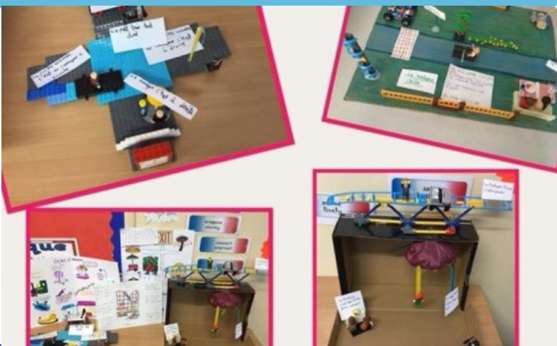
For French homework, Year 7 created theme parks and recorded their directions, using a book creator app and Lego.