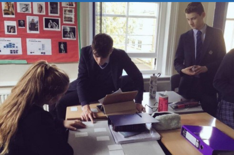
Year 10 GCSE PE pupils have been recapping key facts by making their own revision cards and playing question/answer with them.