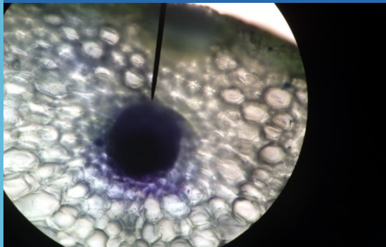
In Year 12 Biology students have been checking out xylem and phloem in celery! Dyed and prepared by a student.