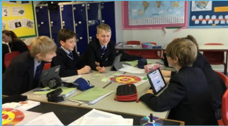
Year 7 geographers are playing a 'race to the centre of the earth' game. The winner will be the one who can answer the most questions on plate tectonic theory!