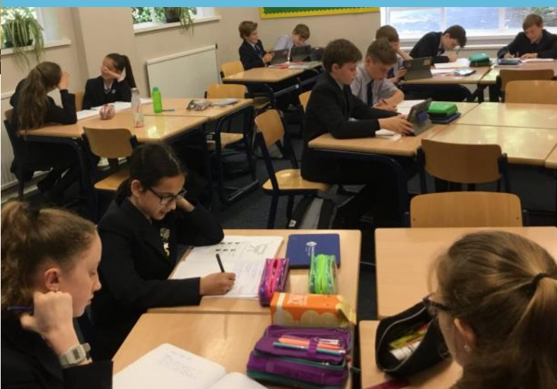
Year 7 have been working hard preparing for a balloon debate.