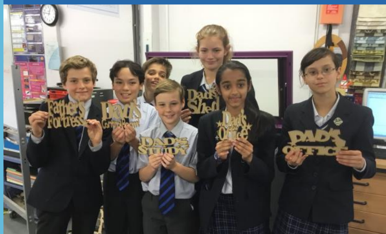
Year 7 proudly showing off their CAD/CAM door signs designed on CorelDRAW and cut out on the laser cutter.