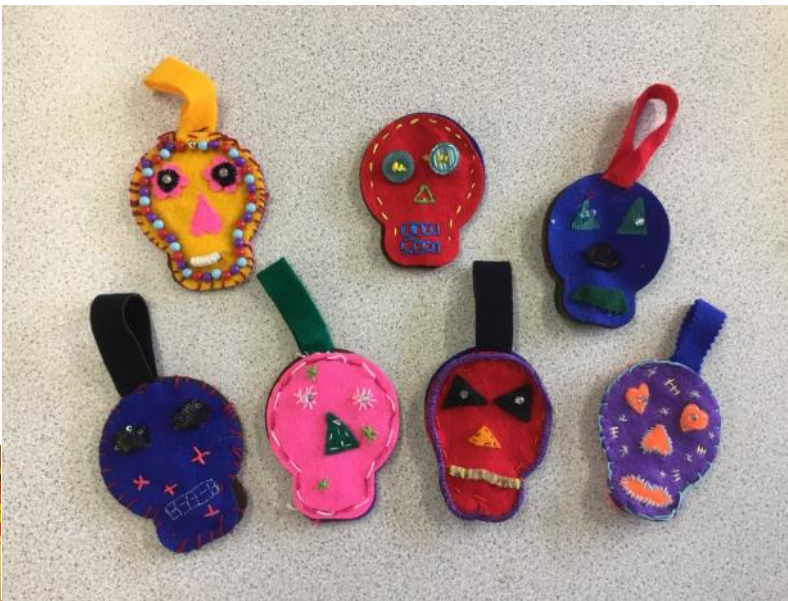
Year 8 have been using soldering electronics, sewing conductive thread, using CAD/CAM - lots of fine motor skills involved with this e-textiles project.